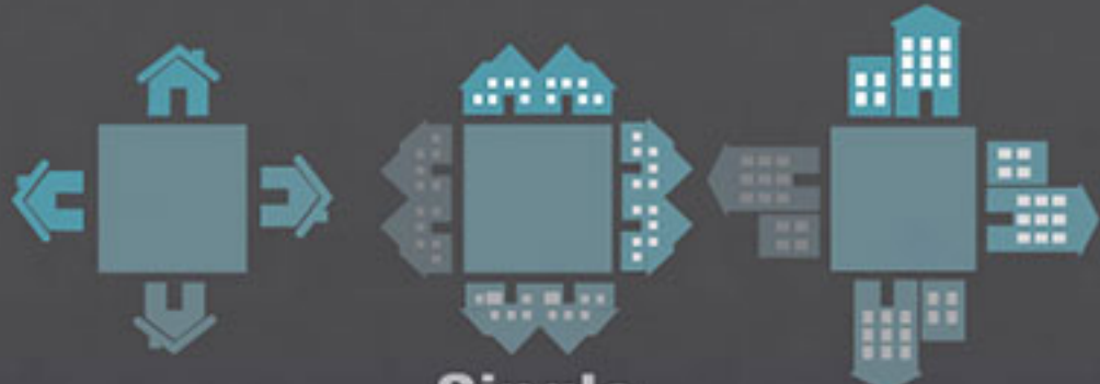
Single Semi-Detached Apartment Hotel 2-Storey 1 around a shared common area