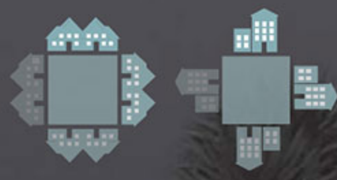
Semi-Detached Apartment Hotel 2-Storey 1 around a shared common area