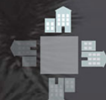
Apartment Hotel 2-Storey 1 around a shared common area