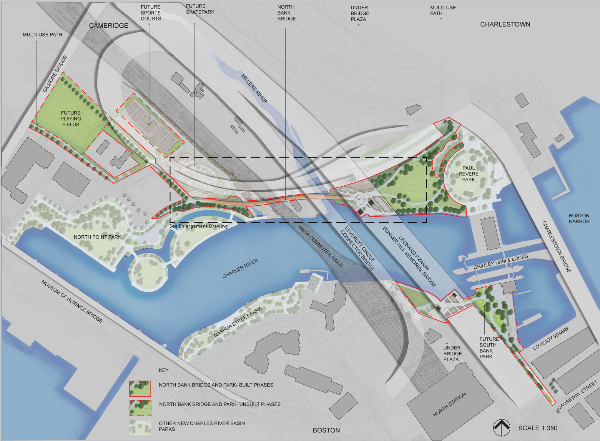
OVERALL SITE PLAN