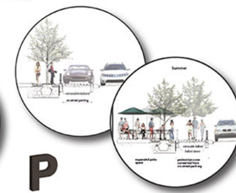
FLEXIBLE SIDEWALK/PARKING SYSTEM