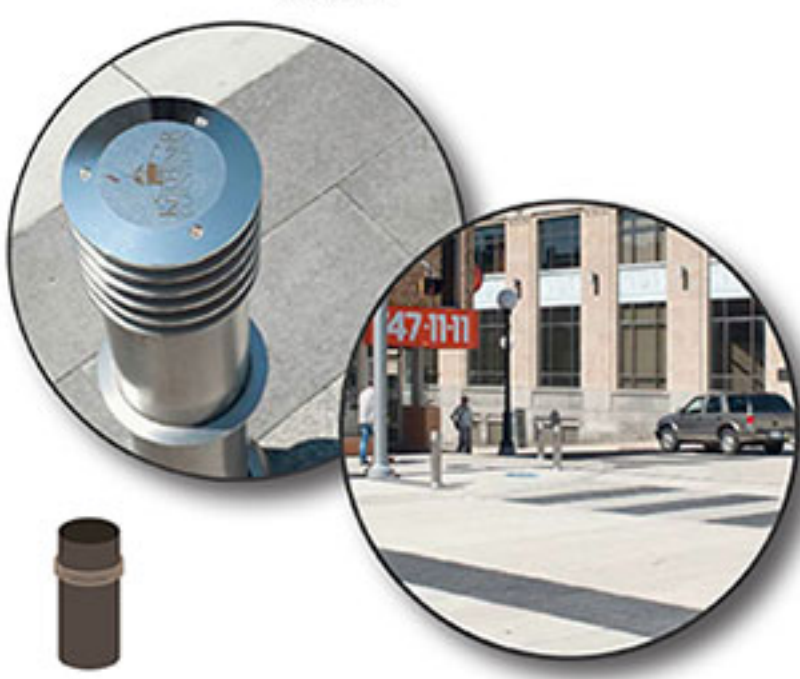
BOLLARDS & CROSSWALKS